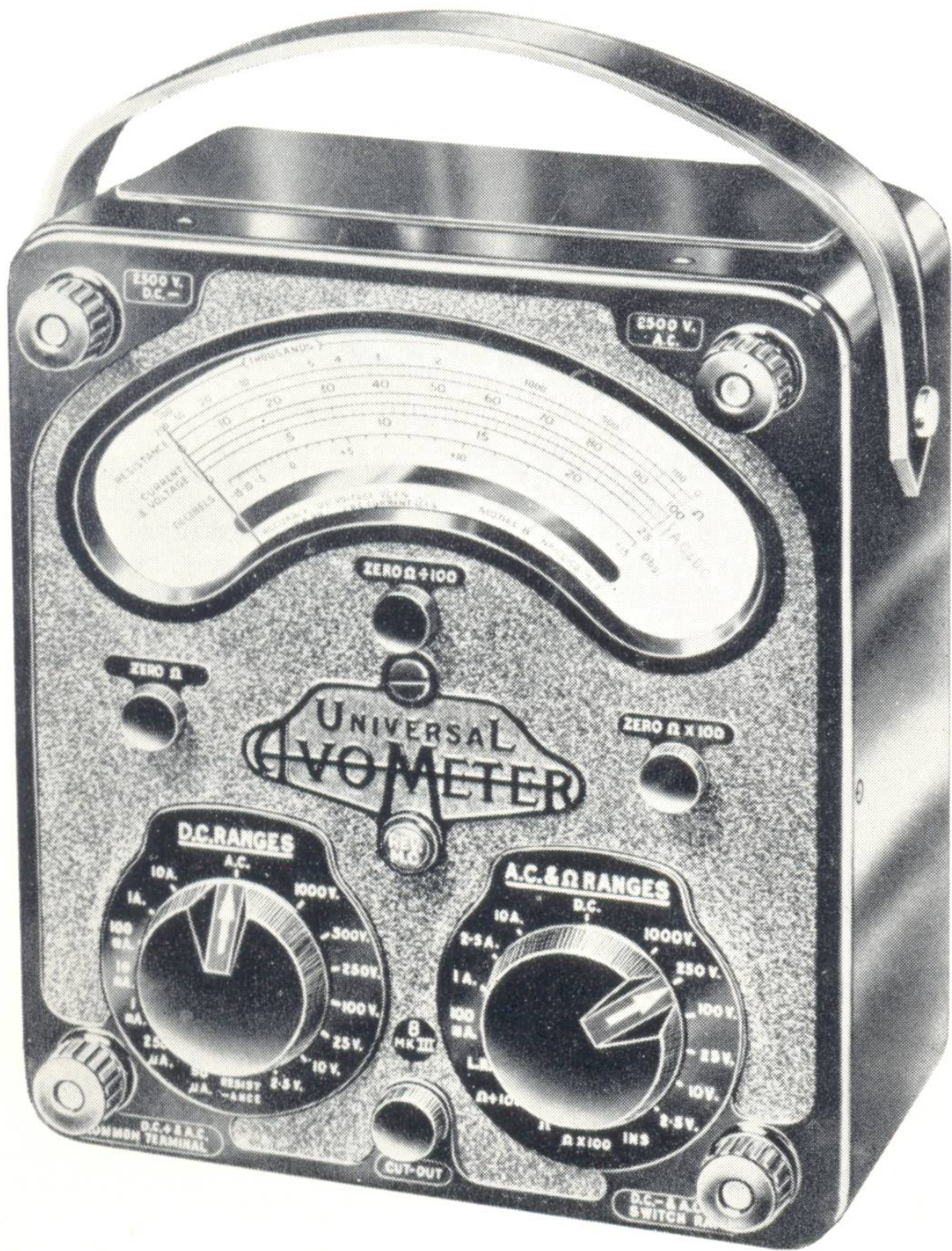
THE MODEL 8 AVOMETER Mk. III